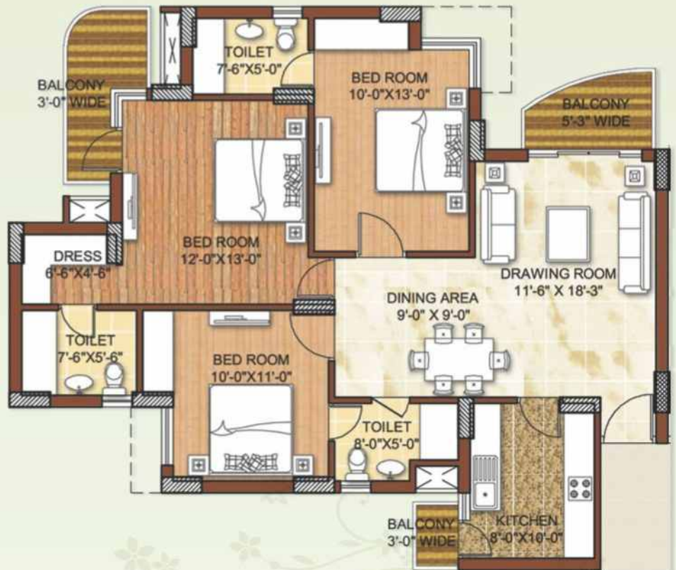
Area-1622 sq.ft. approx