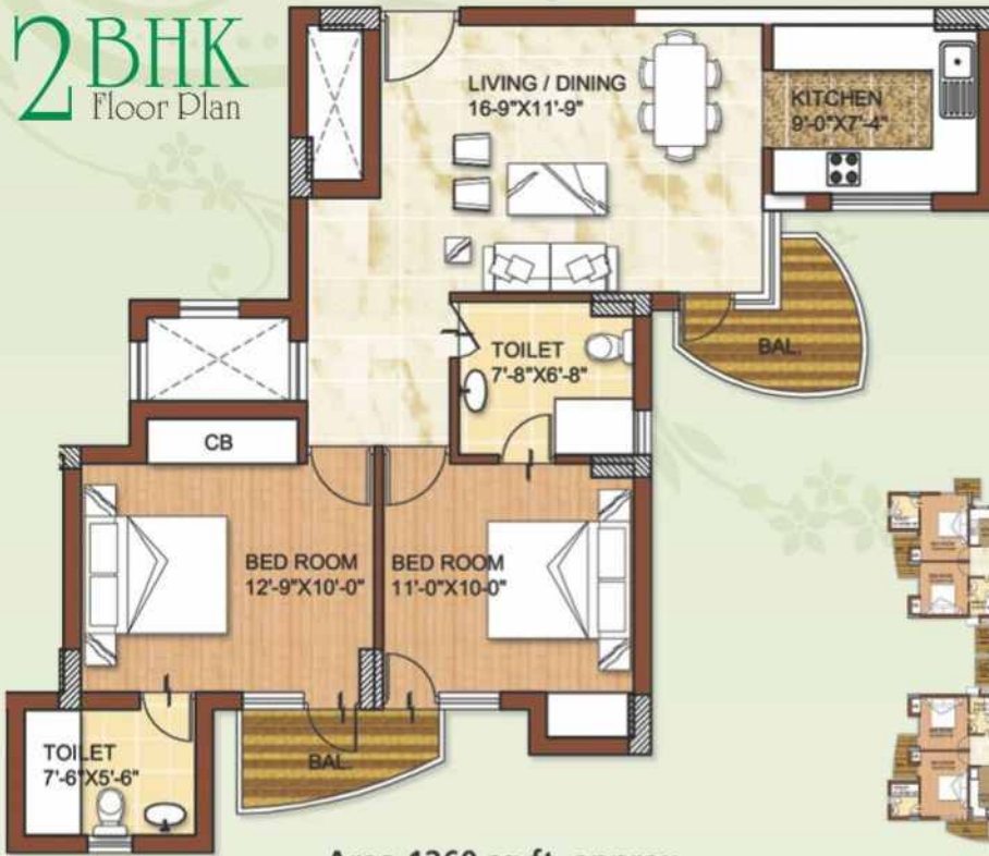
Area-1260 sq.ft. approx